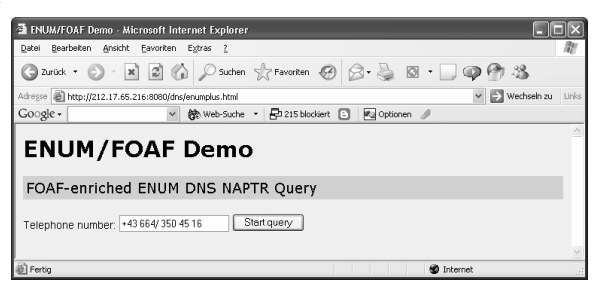
Fig. 3. Screenshot of start screen for ENUM / FOAF demo with telephone number needed as input and "Start query" button

Figure 3 shows the start screen of the demo application with a field to type in a telephone number and a button to start the integrated ENUM / FOAF query and parsing process.